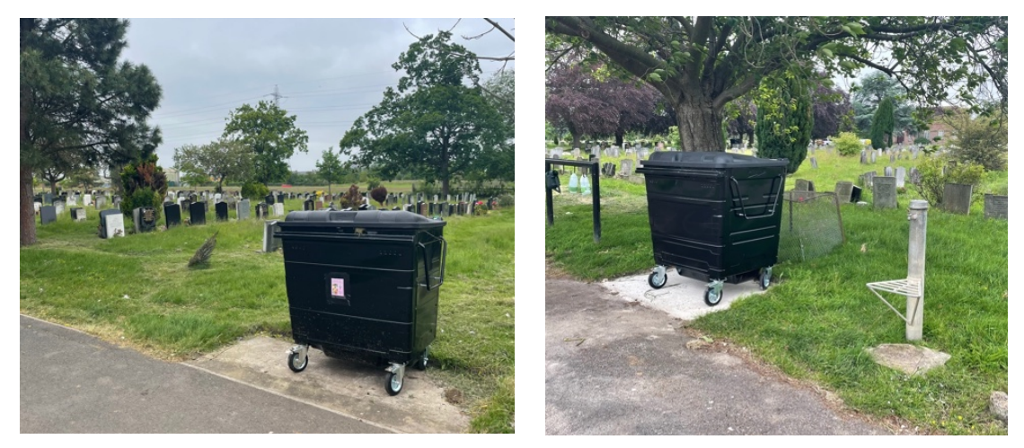
Black Euro-bins at MSJC