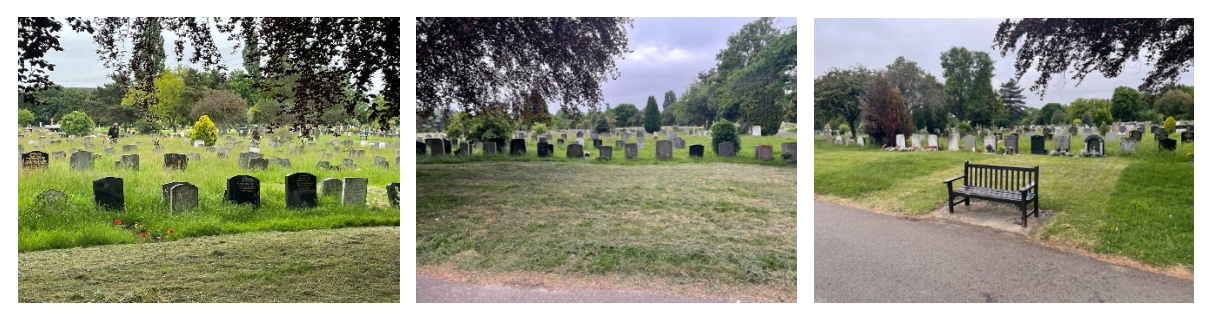
Grass swathes cut on main access paths and around features

weather early in the season but a robust catch up program is currently in place to catch up with extra resources deployed by IdverdeUK.